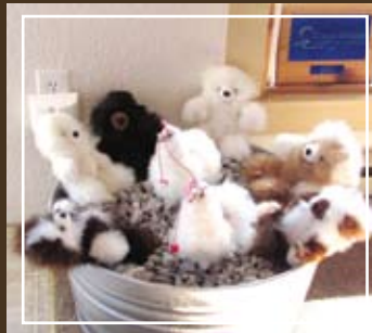
Alpaca Toys and Stuffed Animals