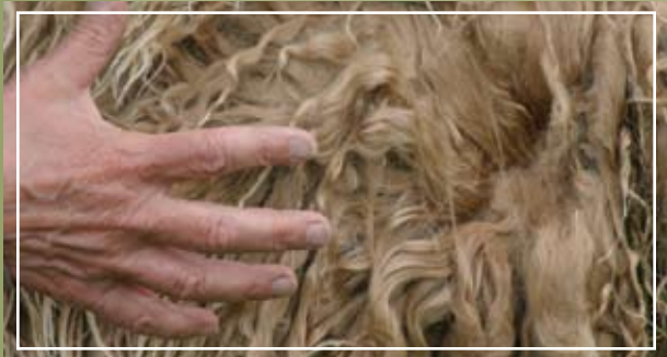
Luxurious Alpaca Fiber and Retail