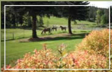
And Fabulous Views