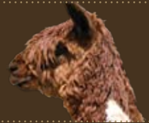
Alpaca Hats, Gloves and Scarves