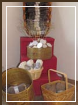
Alpaca Gift Basket, Yarn, Socks and Goat Milk Soap