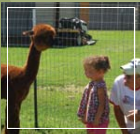
Alpacas, Alpacas, Alpacas!!!